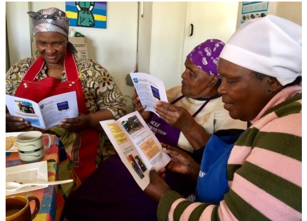
Above: Teddies for Christmas! Food service. Three of the gogos reading our last newsletter with great interest

We've seen huge increases in electricity and food costs this year but remain an extremely cost-effective programme. It costs about R1.50 for each bowl of food prepared.