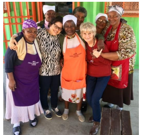
Above: Food preparation; Grade R children line up for their food; the gogos and volunteers outside the soup kitchen